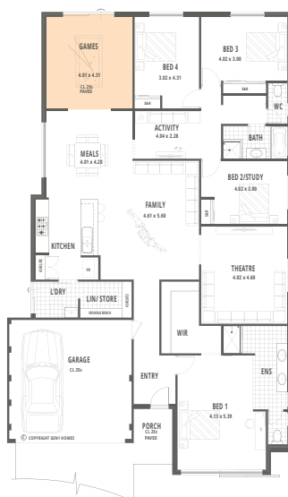
THE CHICAGO - CHOICE 2 Amend alfresco to games room