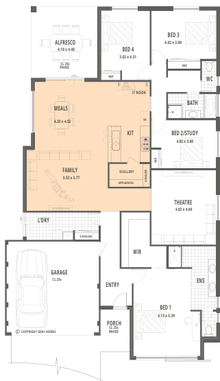
THE CHICAGO - CHOICE 1 Amend layout of kitchen and provide scullery