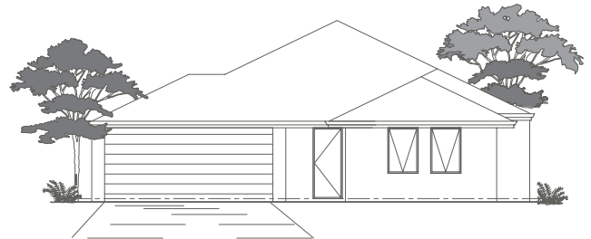
THE CHICAGO - ELEVATION 2