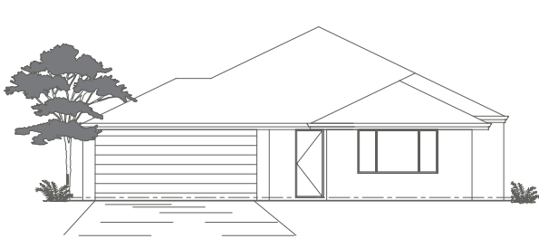
THE CHICAGO - ELEVATION 1

Our New 4 step process introduces CHOICE. At GEN1 Homes we work harder for you to ensure you receive an extensive range of CHOICES that will not break your budget. We offer and explore options to tailor your design plans and remain dedicated by offering CHOICE of layout with each design and CHOICE of elevation at no extra cost. Our range of additional extras is endless and unlike others, you are not limited to the basics, enabling you to add your personal touch.