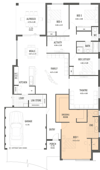
THE CHICAGO - CHOICE 3 Amend walk in robe to dressing room in master bedroom