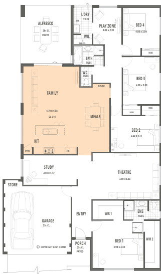
THE CONCERTO - CHOICE 1 Relocate kitchen and family