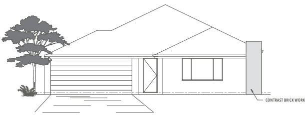
THE CONCERTO - ELEVATION 1

Our New 4 step process introduces CHOICE. At GEN1 Homes we work harder for you to ensure you receive an extensive range of CHOICES that will not break your budget. We offer and explore options to tailor your design plans and remain dedicated by offering CHOICE of layout with each design and CHOICE of elevation at no extra cost. Our range of additional extras is endless and unlike others, you are not limited to the basics, enabling you to add your personal touch.