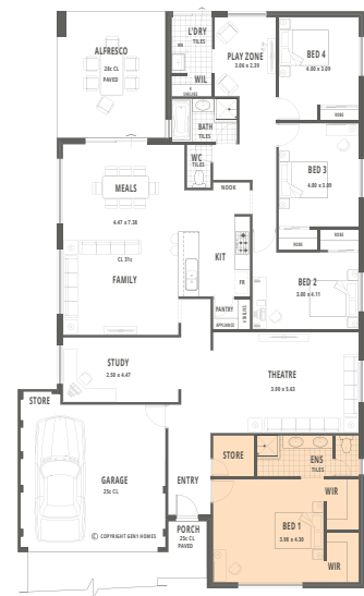
THE CONCERTO - CHOICE 3 Increase size of ensuite, amend his & her robe location and add store