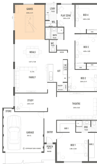
THE CONCERTO - CHOICE 2 Amend alfresco to games room