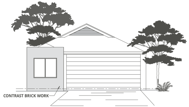
THE RUBENS - ELEVATION 2