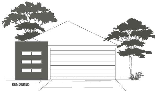
THE RUBENS - ELEVATION 1

Our New 4 step process introduces CHOICE. At GEN1 Homes we work harder for you to ensure you receive an extensive range of CHOICES that will not break your budget. We offer and explore options to tailor your design plans and remain dedicated by offering CHOICE of layout with each design and CHOICE of elevation at no extra cost. Our range of additional extras is endless and unlike others, you are not limited to the basics, enabling you to add your personal touch.